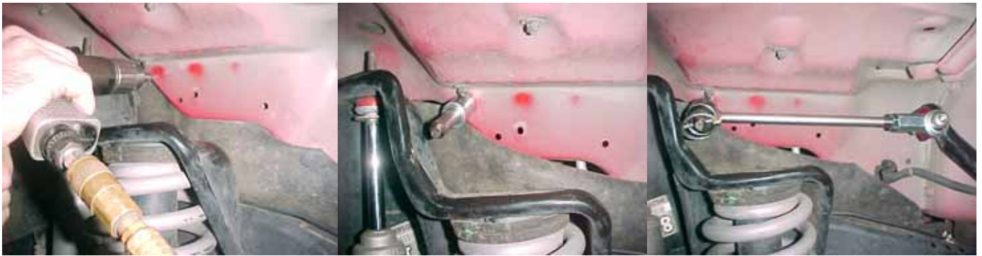
PICTURE -A- MOUNTING PIN HOLE LOCATION & MOUNTING ORENTATION FOR ALL TJ'S

NOTE- ABOVE IMAGE SHOWS 11" DISCONNECTS (P/N RE1142, FOR 4.5-5.5" LIFTS) FOR 2-3.5" LIFTS, 9" DISCONNECTS ARE USED (P/N RE1141), MOUNT PIN APPROX 2" FORWARD FROM ABOVE POSITION FOR 0-2" LIFTS, 7" DISCONNECTS ARE USED (P/N RE1140), MOUNT PIN APPROX 4" FORWARD FROM ABOVE POSITION