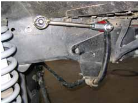
MOUNTING ORENTATION FOR ALL XJ & ZJ'S WITH RE SWAY BAR RELOCATION BRACKETS (P/N RE921)