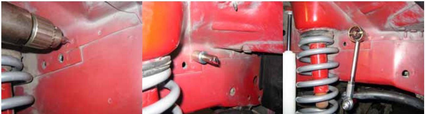
PICTURE -B- MOUNTING PIN HOLE LOCATION & MOUNTING ORENTATION FOR ALL XJ & ZJ'S, W/O RE SWAY BAR RELOCATION BRACKETS (P/N RE921)

NOTE- ABOVE IMAGE SHOWS 11" DISCONNECTS (P/N RE1142, FOR 4.5-5.5" LIFTS) FOR 2-3.5" LIFTS, 9" DISCONNECTS ARE USED (P/N RE1141), MOUNT PIN APPROX 2" FORWARD FROM ABOVE POSITION FOR 0-2" LIFTS, 7" DISCONNECTS ARE USED (P/N RE1140), MOUNT PIN APPROX 4" FORWARD FROM ABOVE POSITION